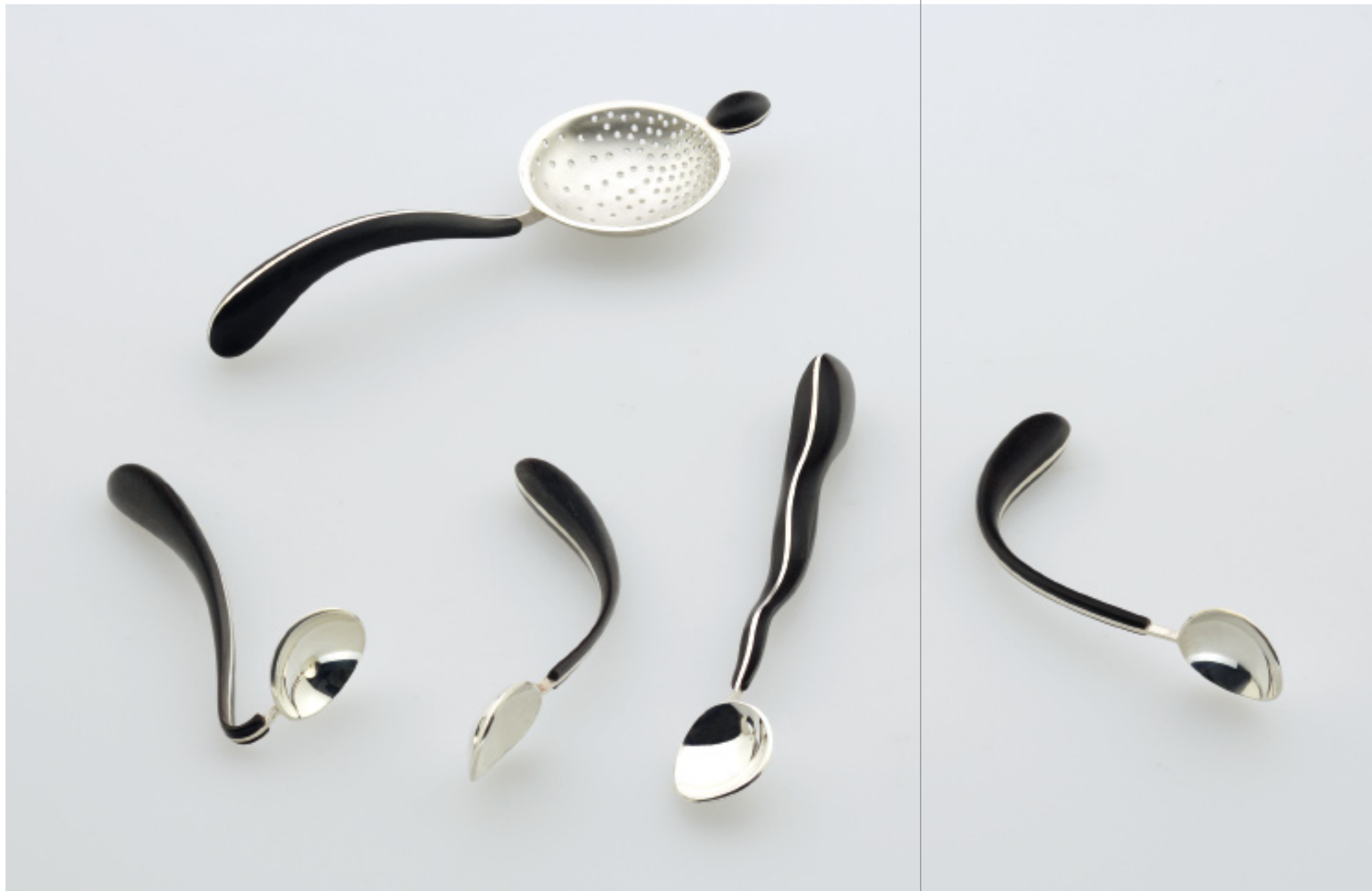
Curiouser, Curiouser! Tea Accessories Teaspoons & Tea Strainer Stg silver, Ebony 2007