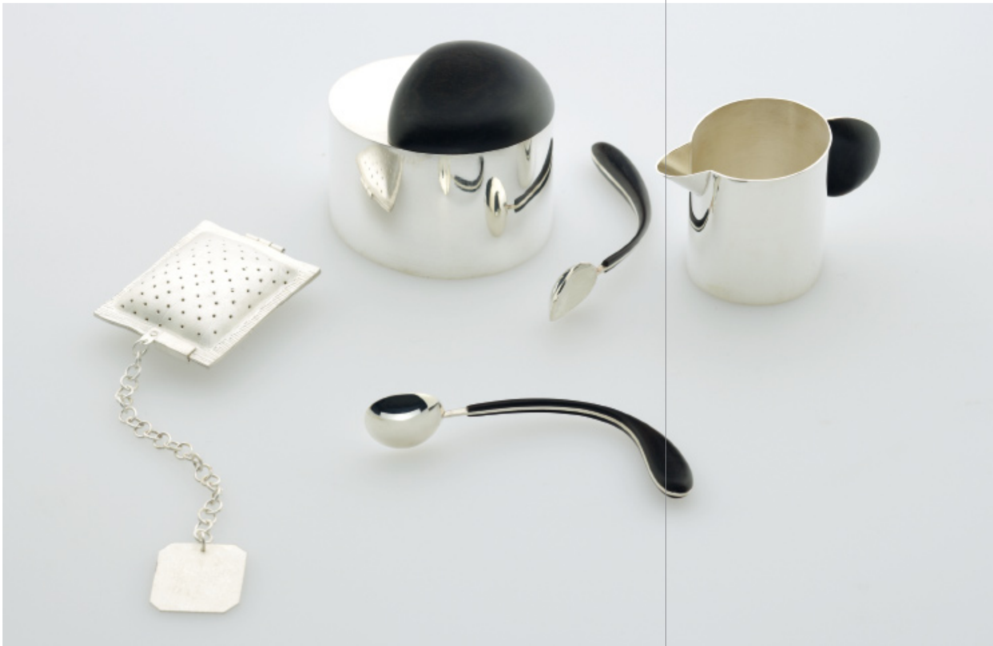
Curiouser, Curiouser! Tea Accessories Sugar Bowl, Milk Jug, Teaspoons & Tea Bag Infuser Stg silver, Ebony 2007