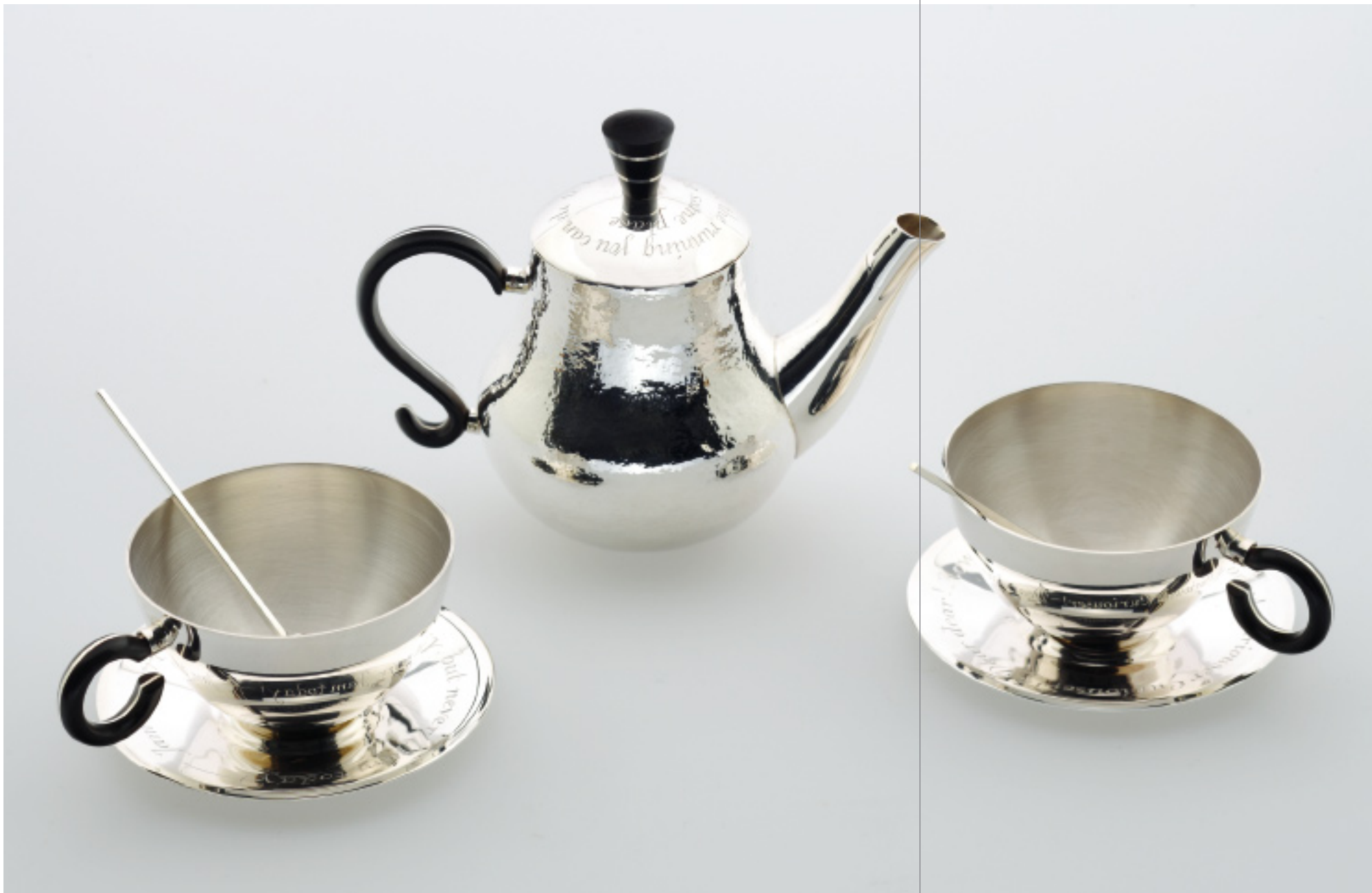
Curiouser, Curiouser! Teapot & Teacups Stg silver, Ebony. 2005